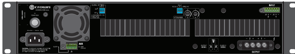
DCi 2|1250 model shown